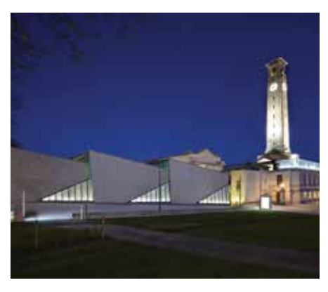
Project: Sea City Museum, Southampton Client: Speymill Construction

Services provided: Cavity wall and floor insulation