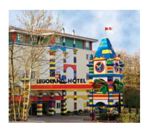
Project: Legoland Windsor Resort Client: Speymill Contracts Services provided: Loft insulation