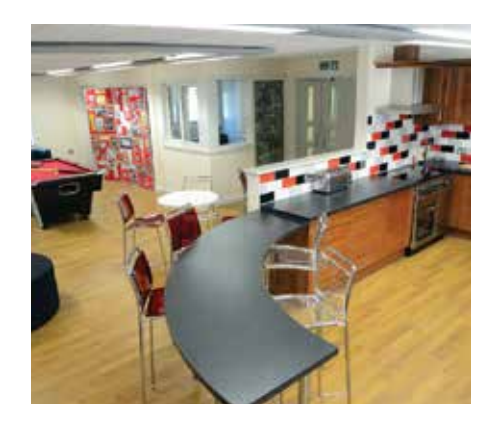
Project: Bradley Youth Hub Client: Seddon Construction Services provided: Timber frame and floor insulation