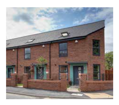
Project: Roebuck Gardens Client: Lovell Services provided: Loft, party wall and warm roof insulation