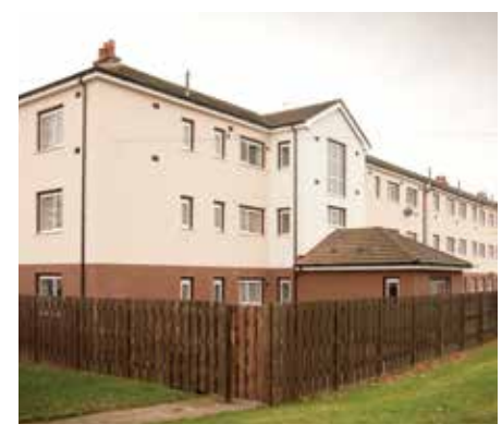
Project: Centenary House, Runcorn